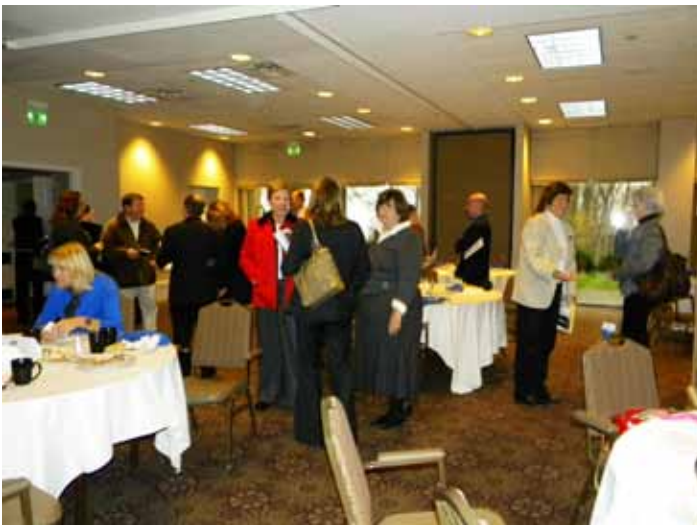
Lots of networking going on!